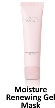
Moisture Renewing Gel Mask