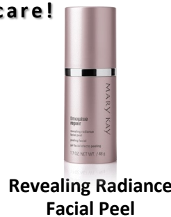
Revealing Radiance Facial Peel