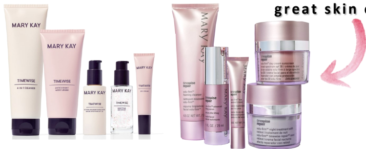
TimeWise Ultimate Miracle OR TimeWise Repair

You are invited to start here with great skin care!