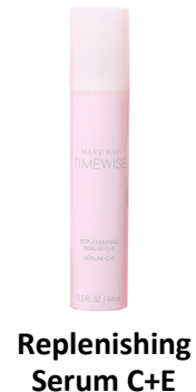
Replenishing Serum C+E